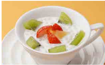
371 Coconutmilk with tapioka ¥580