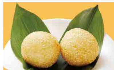
373 Deep-fried sesame balls with jujube paste ¥660