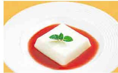
372 Almond jelly with bayberry sauce ¥700