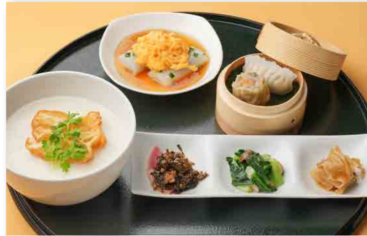
211 Plain Congee&Dim sum ¥1,600