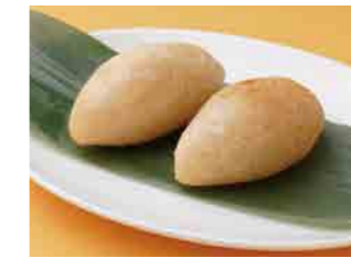
294 Deep-fried stuffed dumpling ¥600