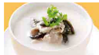
225 Pork and Century egg Congee (small) ¥770 ¥1,100