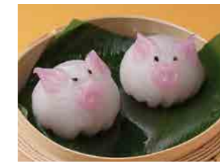
283 Piglet style dumpling ¥800