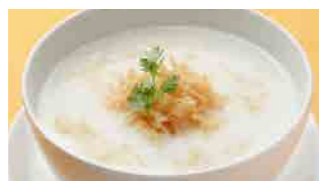
226 Dried-conpoy Congee (small) ¥840 ¥1,200