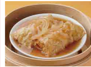
289 Steamed stuffed bean-curd skin roll with oyster sauce ¥900