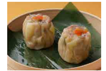
284 Steamed shrimp siu mai Hong Kong style ¥500