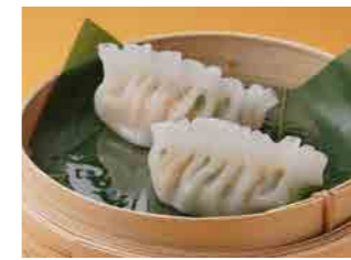
282 Steamed leek dumpling ¥500