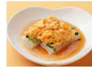
290 Steamed rice noodles (Egg) ¥350