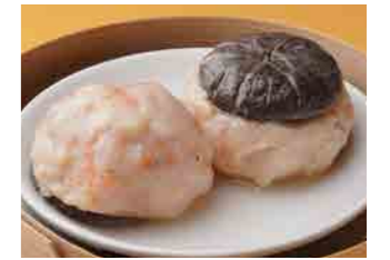
288 Steamed stuffed mushroom with minced shrimp ¥700