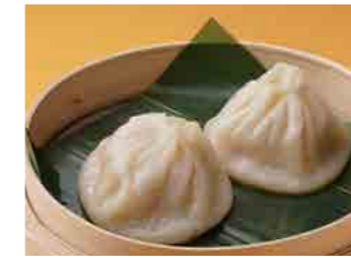
286 Steamed "Xiaolongbao" pork dumpling ¥520