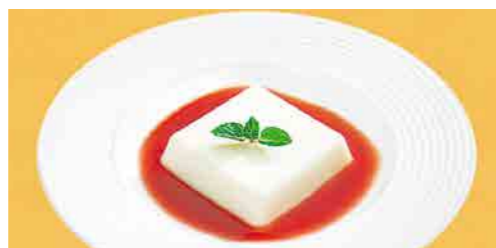
372 Almond bean-curd with bayberry sauce ¥ 750