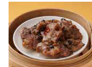
299 Steamed spareribs with black bean sauce ¥980