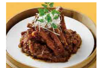
296 Steamed chicken feet with black bean sauce ¥800