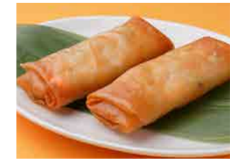
292 Deep-fried spring roll ¥700