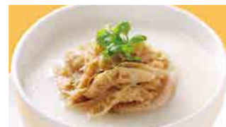
223 Beef tripe Congee (small) ¥560 ¥800