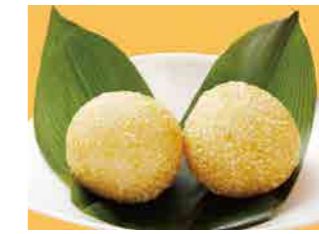
295 Deep-fried sesame balls with jujube paste ¥660