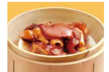
300 Steamed pigs shank with special sauce ¥820