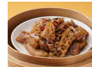
298 Steamed ox-tripe with black bean sauce ¥900