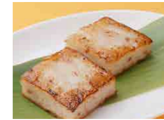
287 Pan fried radish cake ¥580