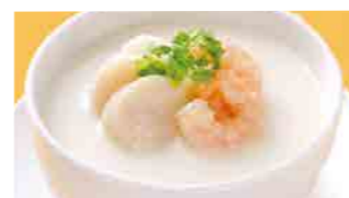
228 Seafoods Congee (small) ¥1,120 ¥1,600