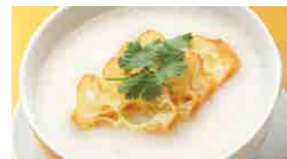
221 Plain Congee (small) ¥420 ¥600