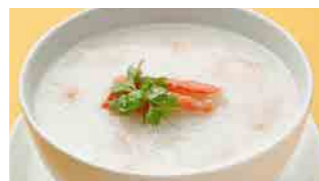
227 Crab-meat Congee (small) ¥1,120 ¥1,600