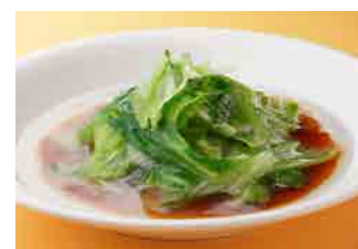
261 Parboiled lettuce with oyster sauce ¥550