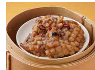
297 Steamed squid with black bean sauce ¥1,300