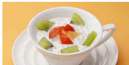
371 Coconutmilk with tapioka ¥ 700