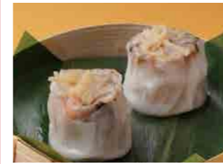
285 Steamed stuffed dried-conpoy siu mai ¥860