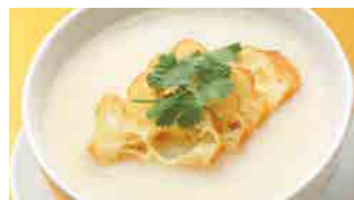
222 Soy milk Congee (small) ¥420 ¥600