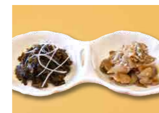
264 Pickles set (takana&zha cai) ¥400