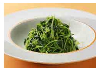
262 Wok-fried pea sprout with garlic ¥800