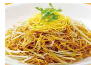
263 Fried noodles with leek & bean-sprout ¥1,200