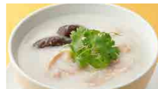
224 Chickn Congee (small) ¥630 ¥900