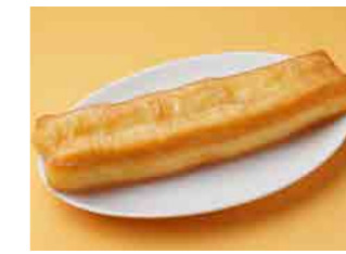
291 Fried bread stick ¥300