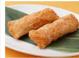
293 Deep-fried shrimp roll wrapped in rice paper ¥940