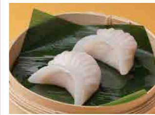
281 Steamed shrimp dumpling ¥480